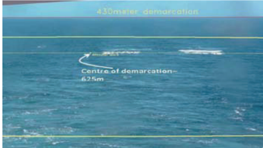
Horizon detection and demarcation zone around the sound source

Seiche's proprietary software has two components: RADES accurately assesses the distance and range of objects at sea and provides an overlay of a specified mitigation zone. This enables robust decision making on the position of an animal that is both objective and recordable. The Automated Recognition of Cetacean (ARC) software builds on the RADES framework to provide automated detection of marine mammals and assists a visual observer in locating animals at the surface.