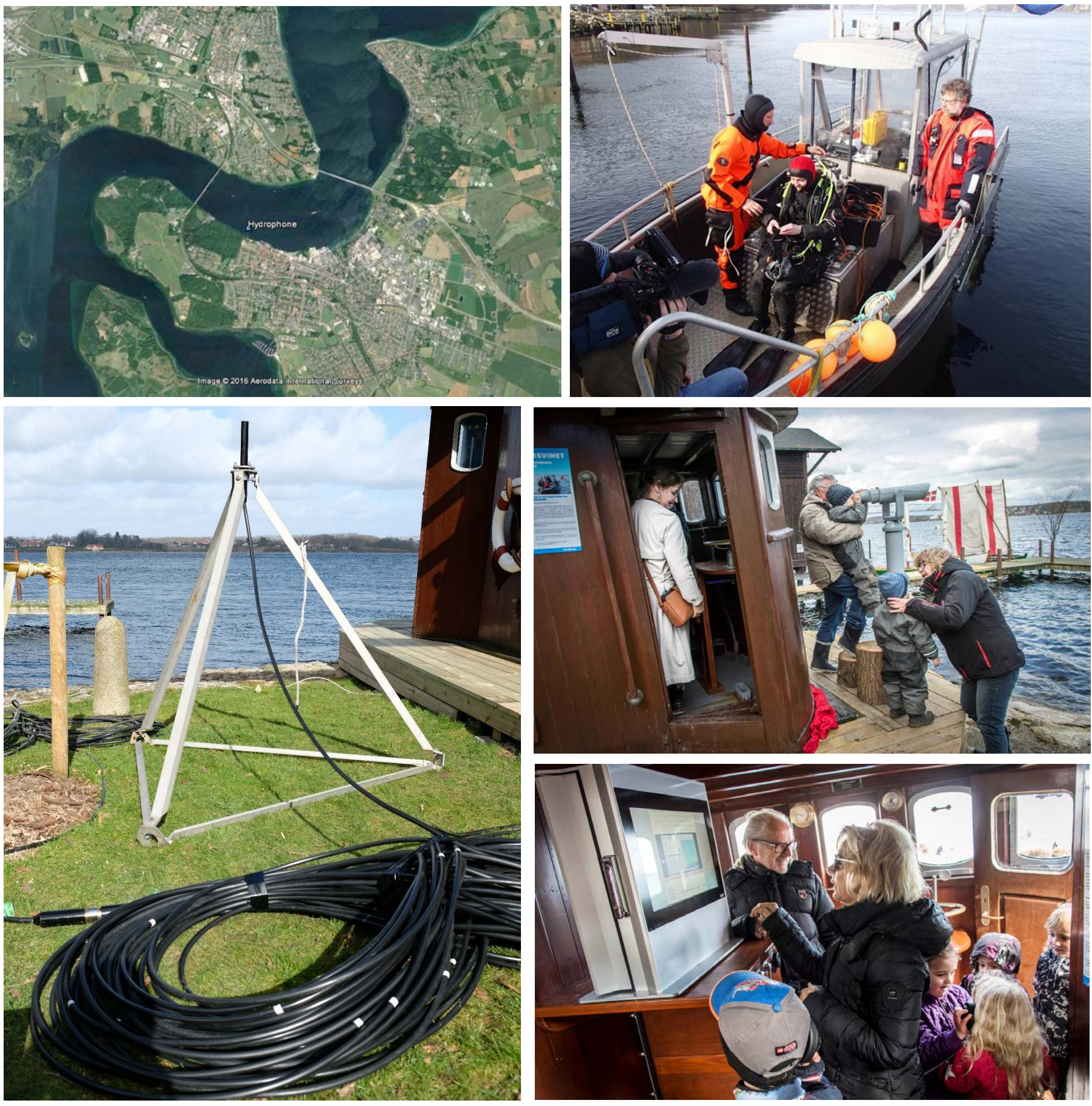
Top left; location of PAM station in Little Belt. Top right; divers preparing for the deployment of the station. Bottom left; PAM station and cable on land prior to deployment. Middle and bottom right; public exhibition on land.

The main purpose of this collaboration is to create an online platform for public awareness and conservation of harbour porpoises; to collect data on harbor porpoise utilization of the artificial reef; and to investigate the potential effects of vessel noise on porpoise behaviour. Here we present the structure and outcome of the online platform.